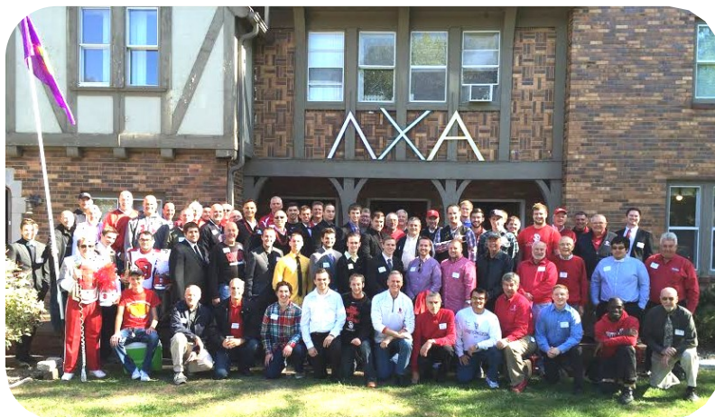
Alumni and Active Brothers at D-Days 2014

We look forward to seeing you at the 2015 Dakota Days celebration and the Centennial Celebration in the spring of 2016!