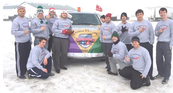
Lambda Chi Alpha Football Run

with the execution of this event and outfitted the entire chapter with sweaters for the event and also provided sweaters for family and friends.