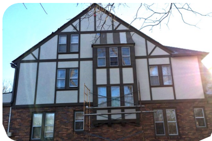
North Side of the Chapter House with New Siding

This renovation builds upon recent Housing Corporation renovations including the remodeling of main floor and complete renovation of 4